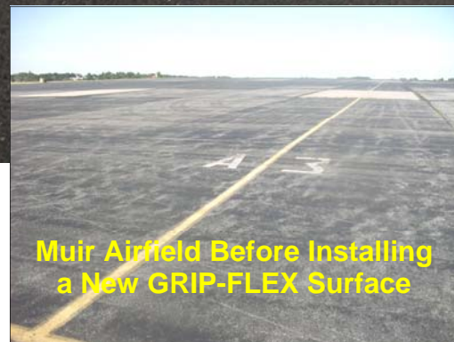
Muir Airfield Before Installing a New GRIP-FLEX Surface

Muir Airfield in Pennsylvania is the second busiest Helicopter Airfield in the world. When they decided to install a new protective wearing surface they wanted something that would perform substantially better than the typical sealcoats and rejuvenators (See Inset which is Muir Airfield with a 5 year old sealcoat) GRIP-FLEX Surfacing offers a very long life expectancy, high visibility, skid resistance and fuel resistance.